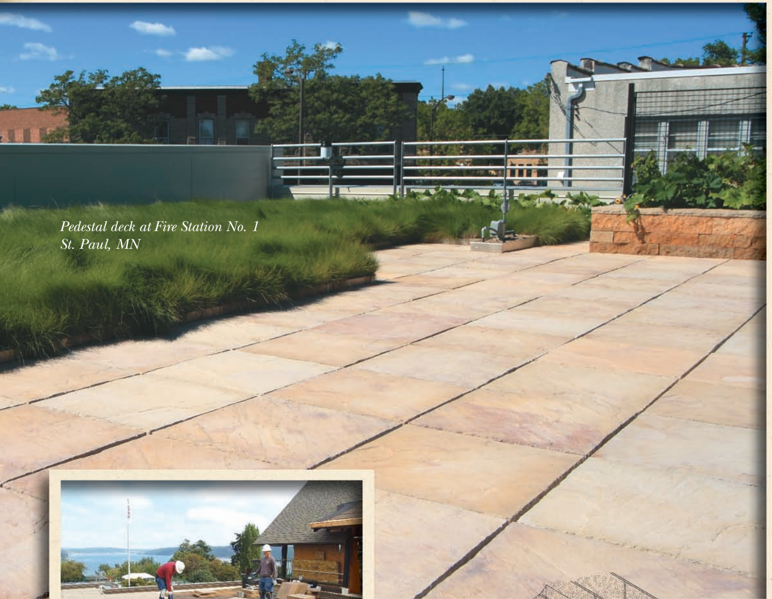
Pedestal deck at Fire Station No. 1 St. Paul, MN