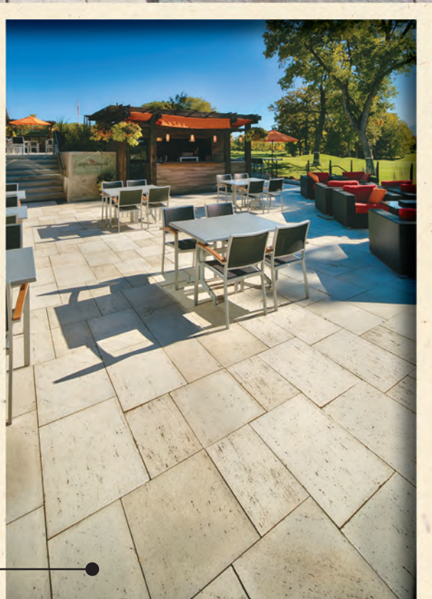
classic travertine has 90° edges and a smooth top